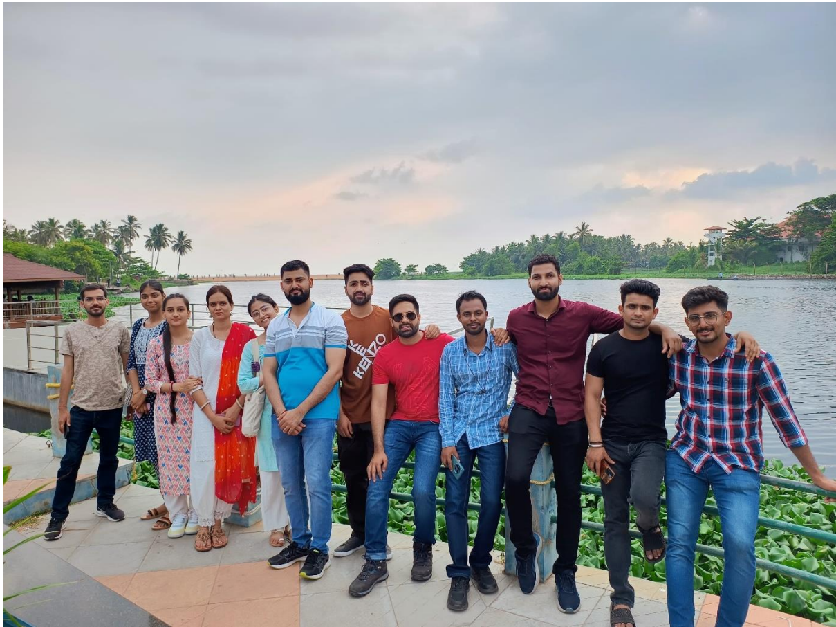
Our group at the veli lake

Everyone was feeling full of energy after having lunch and taking some rest. In the evening we proceeded towards veli village. Veli tourist village lies where the veli lake meets the Arabian sea. It provides unique boating and picnicking opportunities. We returned from veli village by around 8pm and after having our dinner we took a good sleep.