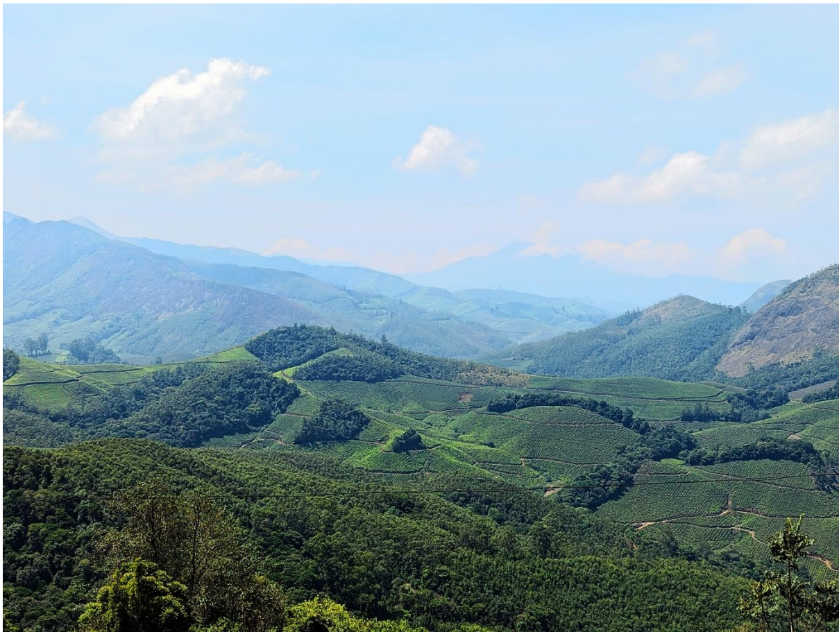
The scenic beauty of Munnar

Munnar's weather is distinct from other parts of Kerala due to its high elevation. Situated in the Western Ghats mountain range, Munnar experiences a cooler and more temperate climate compared to the coastal areas of Kerala. Therefore everyone felt relief from the heatwave.