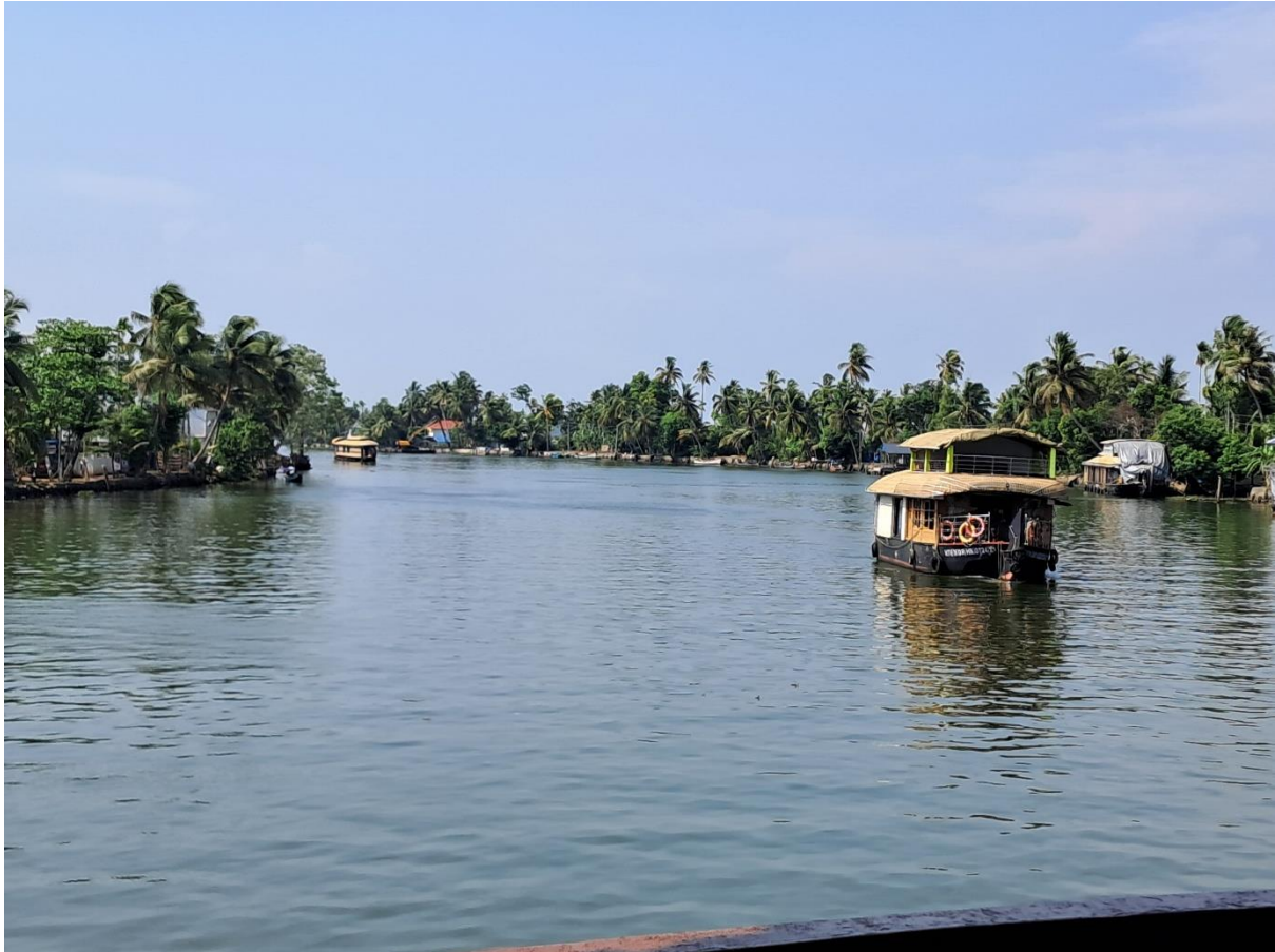
View of backwaters of alleppey from houseboat

At around 9am we departed from Trivandrum to alleppey. We reached our destination at 2pm. Alleppey is famous for its canals, backwaters, beaches and lagoons. We had booked a backwater cruise to see the scenic man made islands and beautiful sights of coconut fringed backwaters and paddy fields. All the staff of the cruiseboat was local and they acted as our guide for the backwaters journey. The cruise started from pamba river and went upto vembanad lake. Total distance covered was around 15km (to and fro). The path traversed by us is part of national waterway 3. The scope of road and railways development in alleppey is limited and that's why the development of waterway in this area has proved to be a boon for traditional industries such as coir, cashew and fishing. It is the first national waterway in the country with 24 hour navigation facilities along the entire stretch.