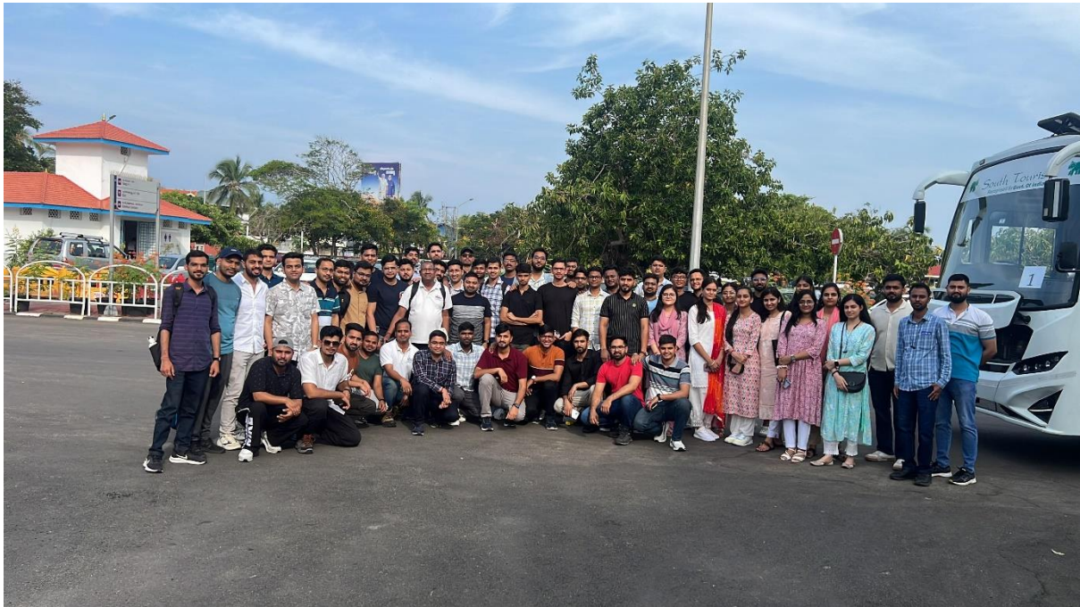
At Trivandrum airport